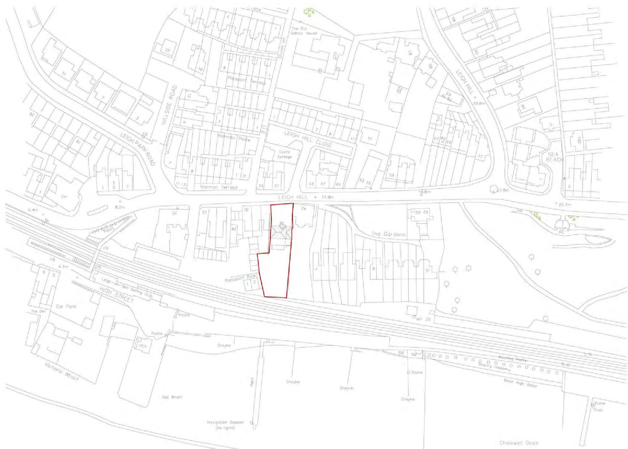
Existing Location Plan - 1:1250