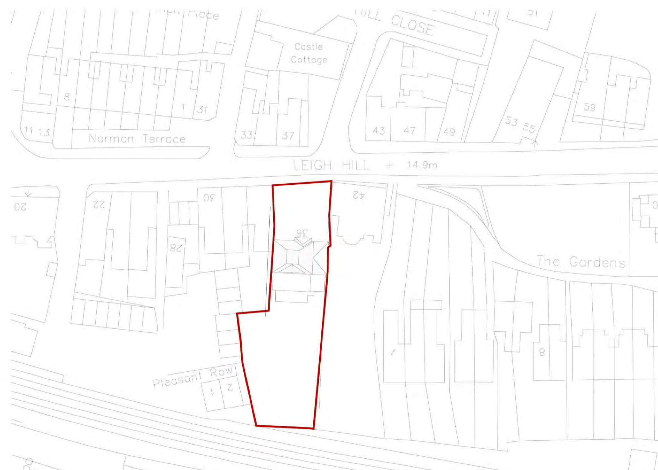
Proposed Block Plan - 1:500