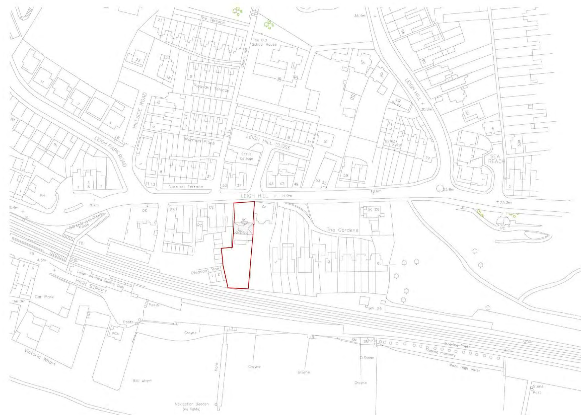
Proposed Location Plan - 1:1250